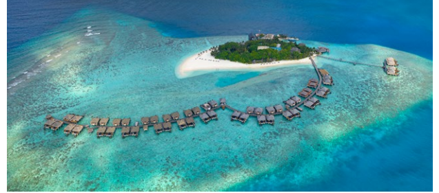
ADAARAN PRESTIGE VADOO