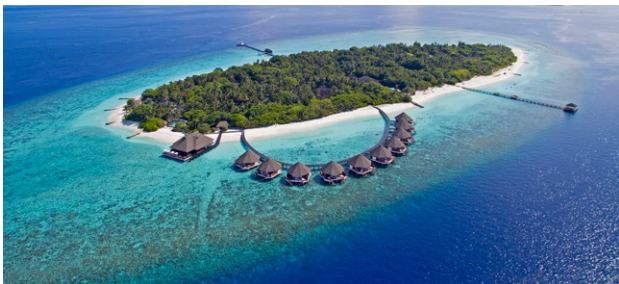
ADAARAN SELECT MEEDHUPPARU