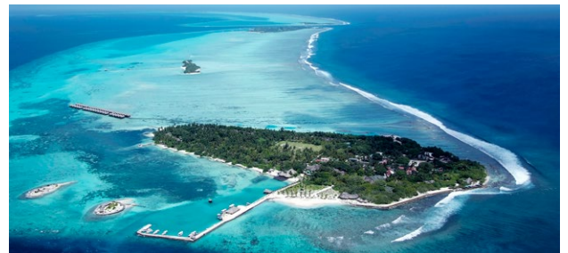
ADAARAN SELECT HUDHURAN FUSHI