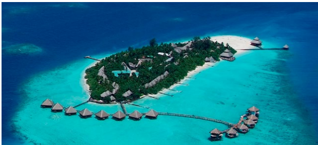
ADAARAN CLUB RANNALHI