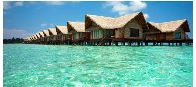
ADAARAN PRESTIGE OCEAN VILLAS